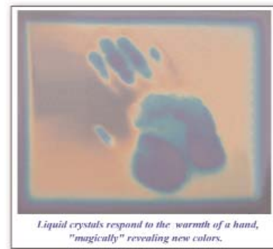
Liquid crystals respond to the warmth of a hand, "magically" revealing new colors.

"The presentation went very well. SciQuest is the local hands-on science museum and they bring in all the sixth grade classes every year. I was very fortunate this year to only have 30 kids with no other groups to follow so I could take more time. The polarization demo was really nice because SciQuest has an exhibit on using polarization to measure stress in bridge supports. The kids had the take-home kit but could also see a very practical application as well."