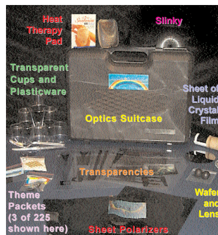
Figure 1. Contents of the Optics Suitcase .

Each Optics Suitcase contains an illustrated copy of our “Educational Outreach Presentation Guide”. This 14-page guide lists the equipment and supplies included in the Optics Suitcase (see Figure 1) and it provides detailed suggestions on how to set up and give a ~40 minute lecture /demonstration. Reusable items include a portable heat therapy pad and “Happy /Unhappy” balls (attention grabbers), a silicon wafer, a lens, a slinky, two high quality sheet polarizers, a sheet of temperature sensitive liquid crystal film and a set of six presentation transparencies. Give-away supplies include 75 copies of the periodic table of the elements (compliments of Mark Glasper and the American Ceramic Society) and 225 “theme packets” that explore color in white light through “Magic Trick” experiments: The Rainbow Peephole ® - color by diffraction (75 ea.), Magic Stripes - color by polarization (75 ea.), and Magic Patch - color by selective reflection (75 ea.).